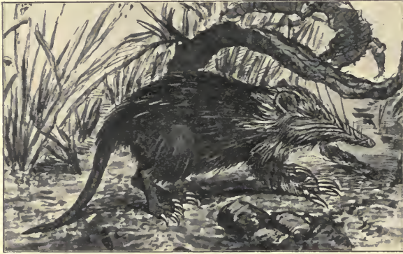
FIG. LXIV. SOLENODON CUBANUS. ALMIQUI.